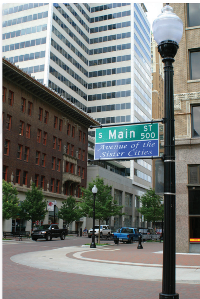
Tulsa, Oklahoma today.