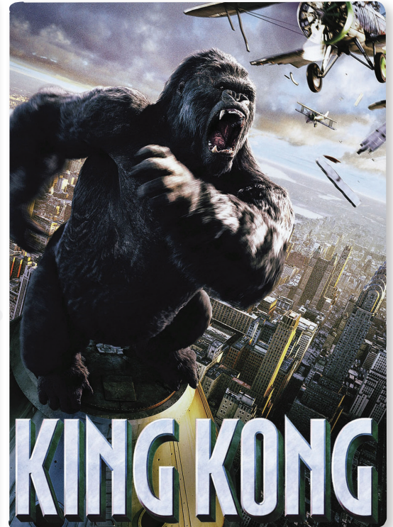
King Kong poster 2005

common hang-out place for all classes of youths.