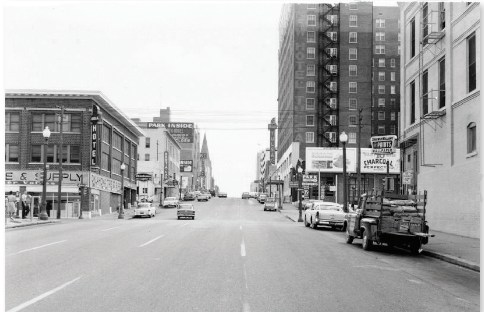
Tulsa, Oklahoma in the 1960's

Write an essay describing Tulsa during that time. Compare it to today. What differences did you find? What similarities did you find? What do you notice about the changes from then to now? How has it grown or stayed the same?