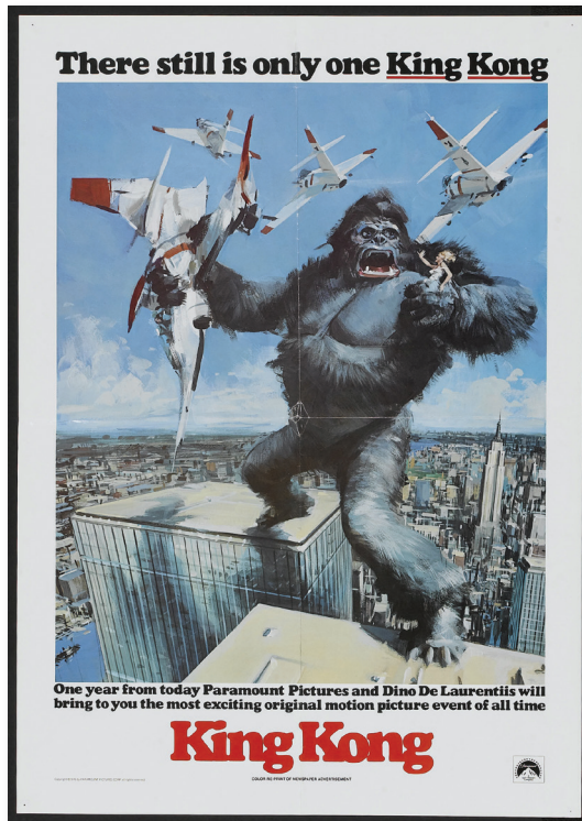
King Kong poster 1976

The novel, The Outsiders , begins with Ponyboy leaving the “movie house” after seeing a movie starring Paul Newman. The next chapter shows him attending a drive-in movie. He lists the many different drive-in theaters in town, and paints a clear picture of it as a