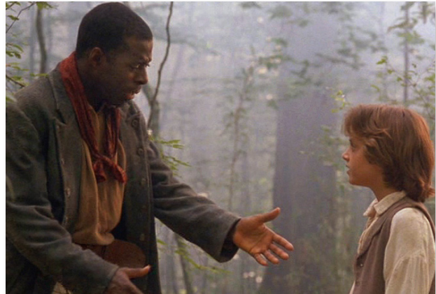
Scene from the 1993 film "The Adventures of Huck Finn"

When you've finished writing your review, trade with a partner who has the opposite or differing opinion on at least one point. Together, use a venn diagram to illustrate where your opinions differed and where they were the same and present your diagram to the class.