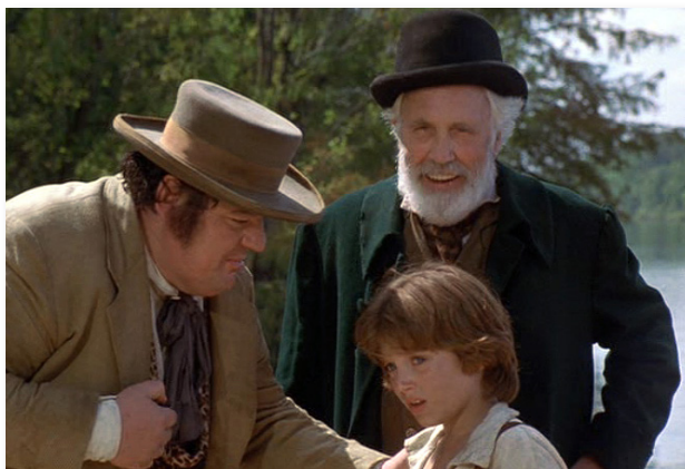
Scene from the 1993 film "The Adventures of Huck Finn"

As a class, discuss how the novel would be different if it were set today and how it would be the same. Discuss how perceptions of the novel changed or stayed the same after reading it. Would you recommend the novel to anyone else?