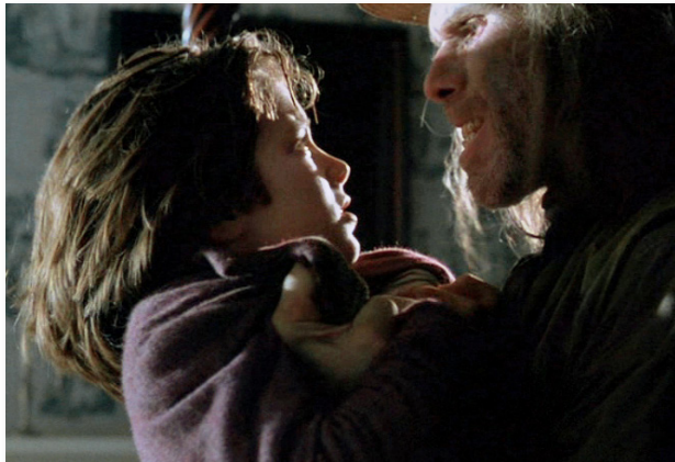
Scene from the 1993 film "The Adventures of Huck Finn"

Now that you've finished reading The Adventures of Huckleberry Finn , what did you think of it? In a book review of at least 700 words, describe why you did or didn't like the novel? What did you like about it? What didn't you like about it? What stood out the most about the book, both negatively and positively? If you were the author, how would you change things.