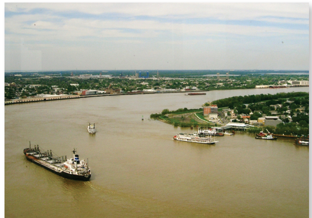
Picture of the Mississippi River now.

Write an essay describing why the river would have played such a big role in people's lives and include at least a paragraph commenting on each of the items listed above. How has the region grown? How has use of the river changed?