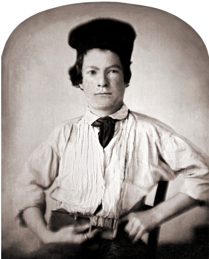
Photo of young Mark Twain aged 15

Examine the notice at the beginning of the book. What is your impression of it? Does it change your opinion of the book? Explain why it does or doesn't. Do you think it's possible for a literary work to have a message if the author didn't intend it to?