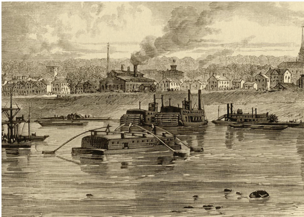
Drawing of the Mississippi River in the 1800s.