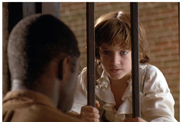
Scene from the 1993 film "The Adventures of Huck Finn"