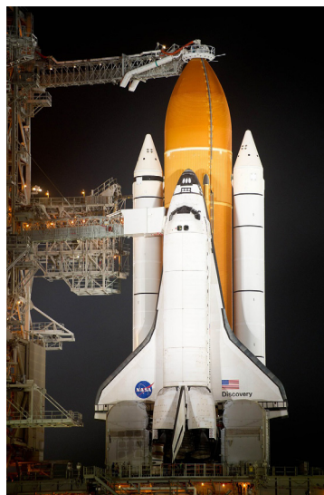
Discovery Space Shuttle