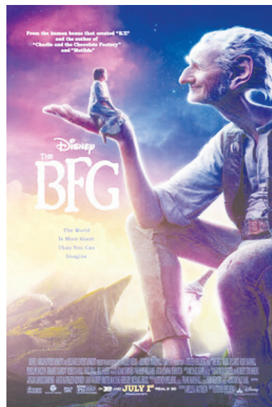
'The BFG' movie cover.

Write the answers to these questions in complete sentences. Get together as a class and take turns sharing your thoughts on the movie. Take a survey of the class to see who liked the movie better. Decide which one the class liked more.