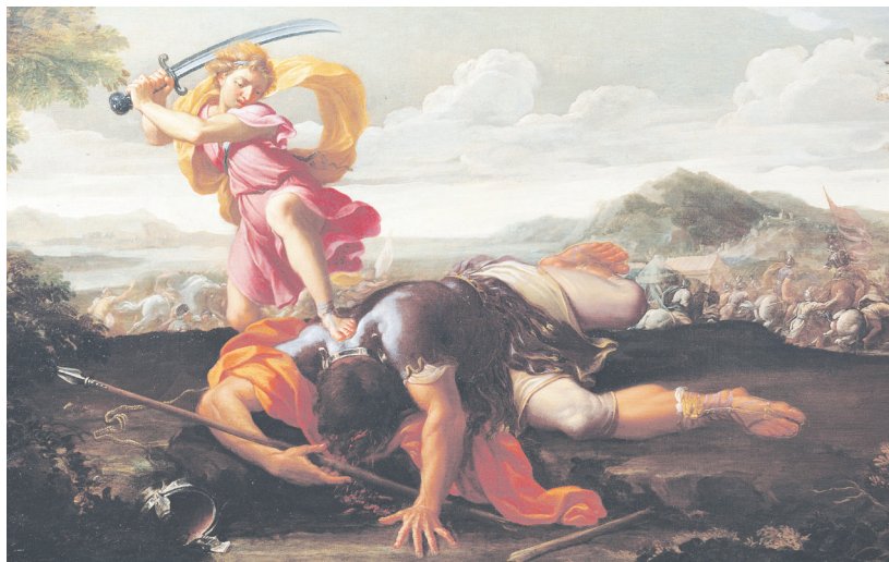
David and Goliath

Why do you think giants are so common in the old stories? Why would ancient people all have similar stories? Write a few sentences on why you believe giant stories are so common.