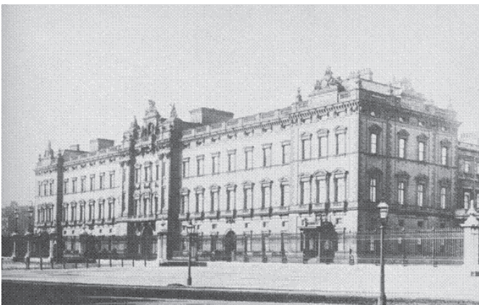
Buckingham Palace 1910.

Finish this activity by writing your own thoughts. Would the story be better if it were set today? Would it be worse?