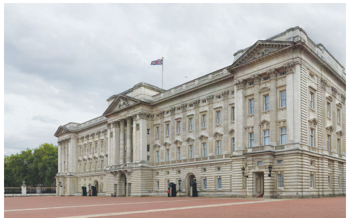
Buckingham Palace 2006.