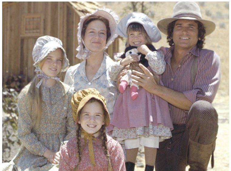
Little House on the Prairie (1974-1983)