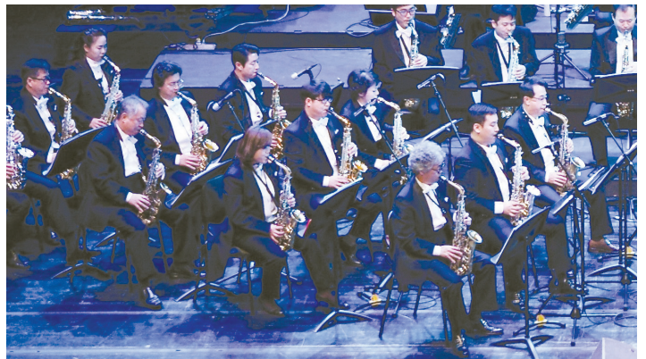
The brass section of an orchestra.