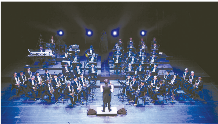
A full orchestra.

It may be a good idea to add lots of color and label each instrument. Feel the music!