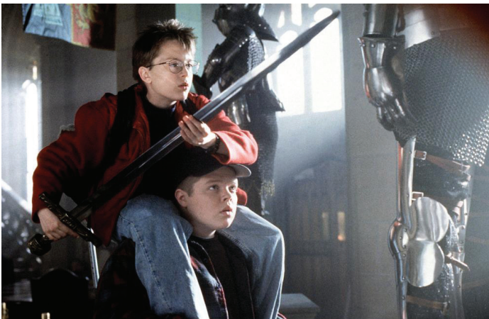
A scene from "The Mighty" (1998)

What do you think is important to show on the poster? What does Freak the Mighty look like to you?