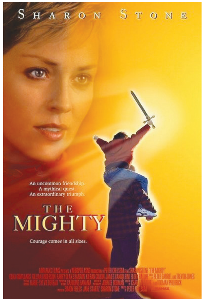
The movie poster for "The Mighty" (1998)