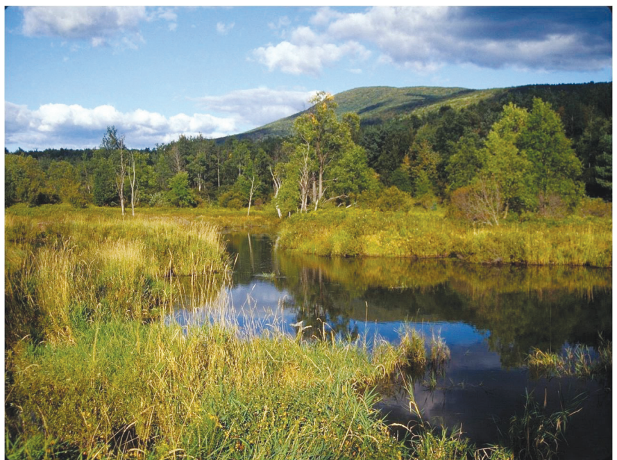
Catskill Mountains and freshwater marsh

When you are done your drawing, write a paragraph that describes the scene. This paragraph should include the page number and the chapter where your scene takes place. The paragraph should also explain what you like about the scene. It should tell why you chose it to be your favorite.