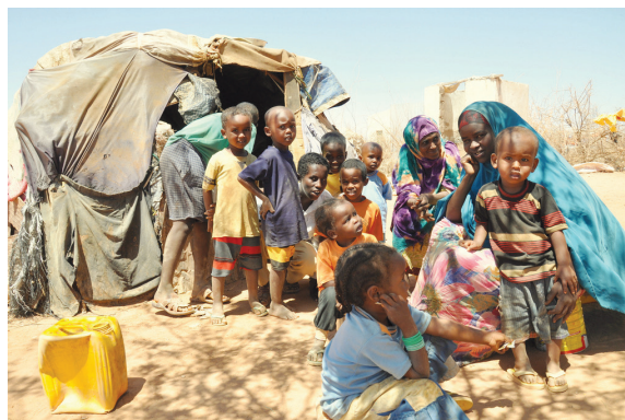
Horn of Africa famine refugee camp.

Maybe you will be inspired to help out this cause. Whether it's money, or your time, refugee families need our care and support. Help make the world a kinder place!