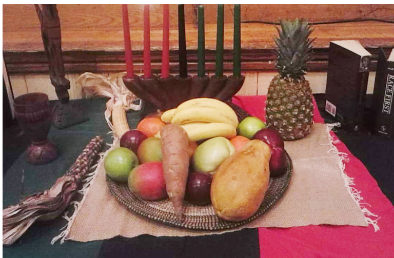
A typical Kwanzaa display.

Compare this holiday with your own traditions. Do you celebrate Christmas or Hanukkah (Chanukah)? Is there another holiday you celebrate instead during this time? Or do you celebrate anything at all? Provide 2 similarities and 2 differences between Kwanzaa and your own holiday.