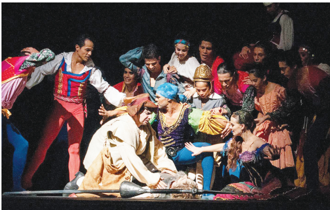
A live performance of Don Quixote