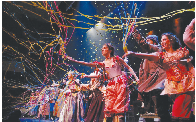
A live performance of Chicago