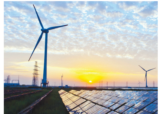
Examples of renewable energy.

People are starting to use more renewable energy sources. What are some renewable energy sources Luke might use in his new life? This picture shows solar and wind. Do some research. Can you find other examples?