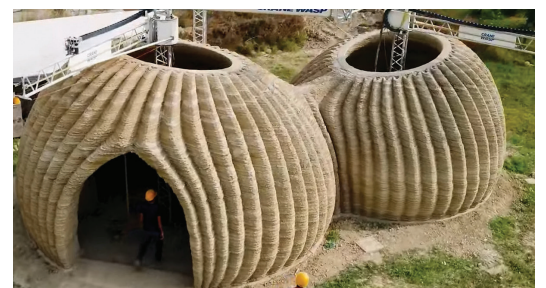
3-D printed clay house.

For more planet-friendly housing ideas, search "carbon-neutral houses" or "net zero houses".