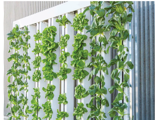
Lettuce growing in a vertical hydroponics garden.

The vegetables grow on shelves. That saves a lot of space! Farmers can grow vegetables in cold countries, even in the winter. How do the plants stay warm? Where do the plants get light and water?