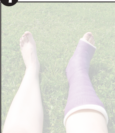
Breaking Her Leg