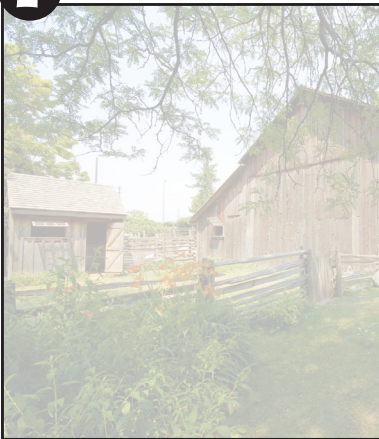
Moving to Avonlea