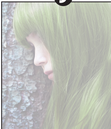
Dyeing Her Hair