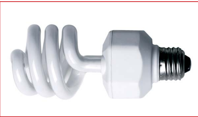
Reduce Energy Usage