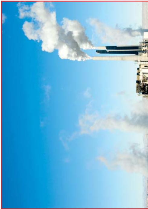
Fossil-fuel-burning Power Plants