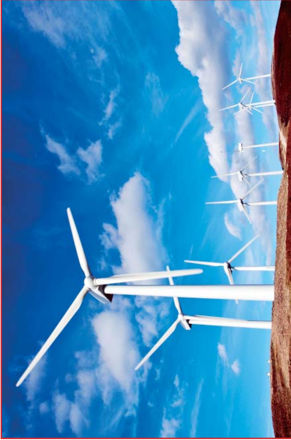
Choose Renewable Energy