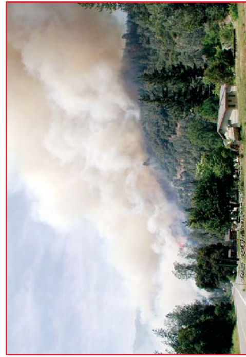
Residential Wood Burning & Forest Fires