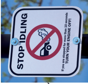
No Idling while dropping off or picking up