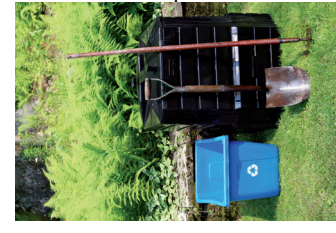
Compost & Recycle as much as you can