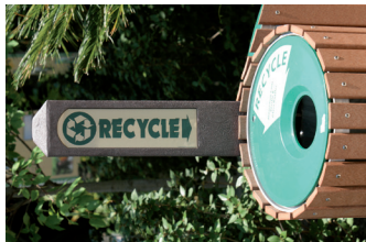
Recycle what you can