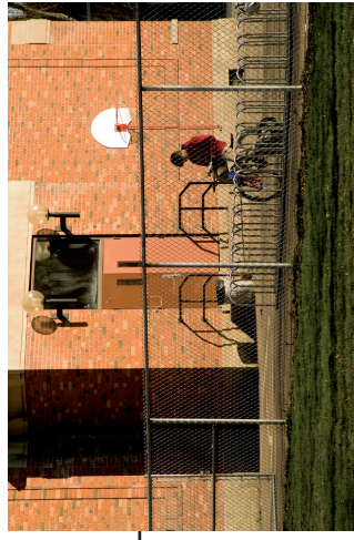
Install Bike Racks & Bike Lanes