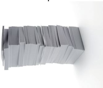
Use both sides of the paper