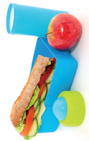
Use Reusable lunch containers