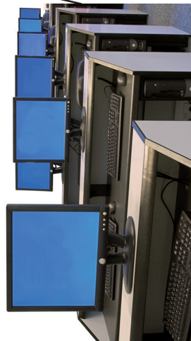
Unplug electrical equipment when not in use