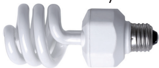
Turn off the lights when not in use (use energy efficient light bulbs)