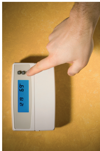
Turn down the heat in the winter Cut back on Air Conditioning in the summer