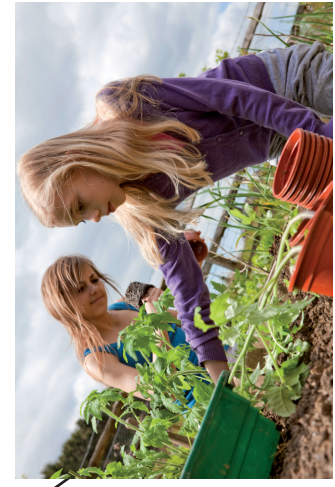
Plant a School Garden