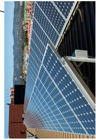
Install Photovoltaic Cells on your School's Roof