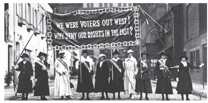
Women's Suffrage movement in Canada in 1876.