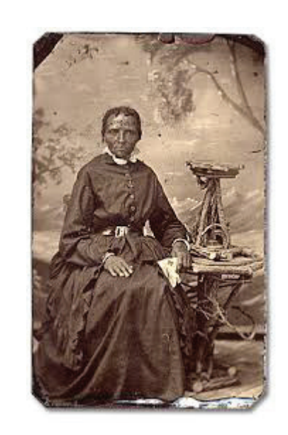
Chloe Cooley was an enslaved Black woman who's struggles led to the Act to Limit Slavery in Upper Canada.