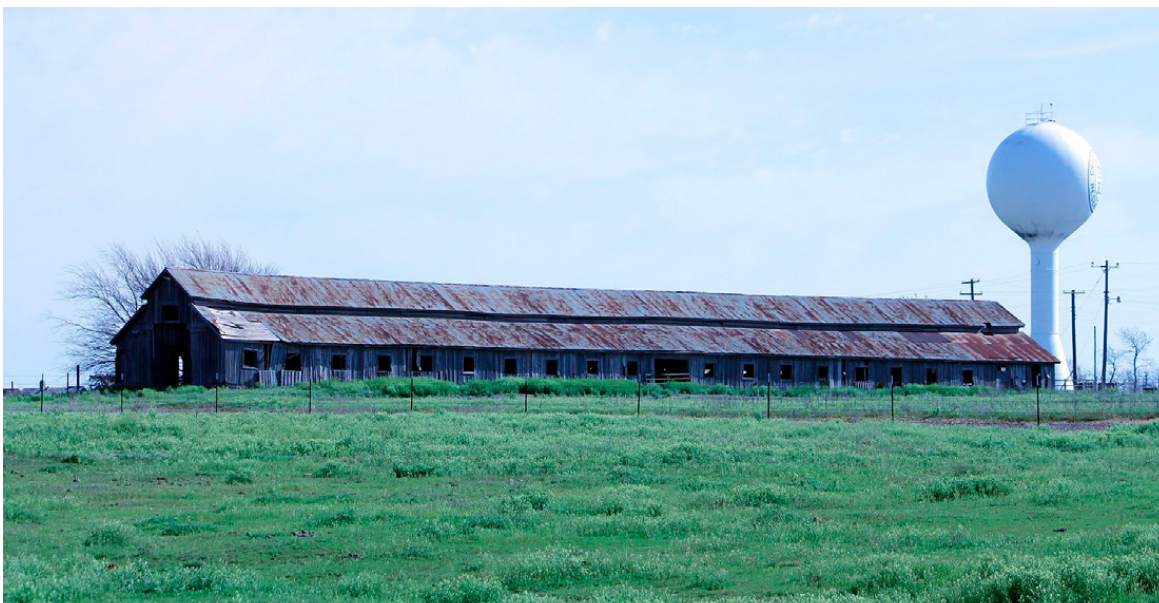
A farm in Oklahoma

Your design should be done as an aerial view. This means it will be drawn as if you were looking at it from above. Think of it as how a bird would see it. You should mark each structure and field with an outline. You may find color coding different areas helpful as well. The sky's the limit with your future farm. You should hope for rainy weather!