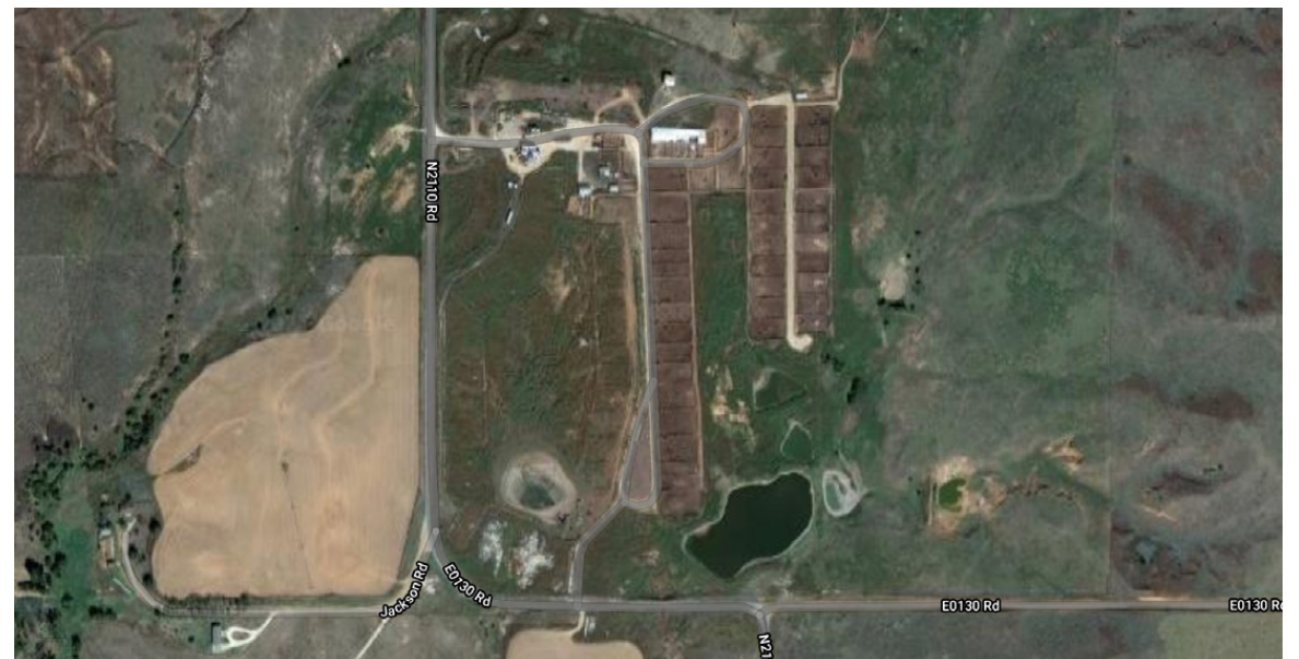
An aerial view of a farm in Oklahoma.