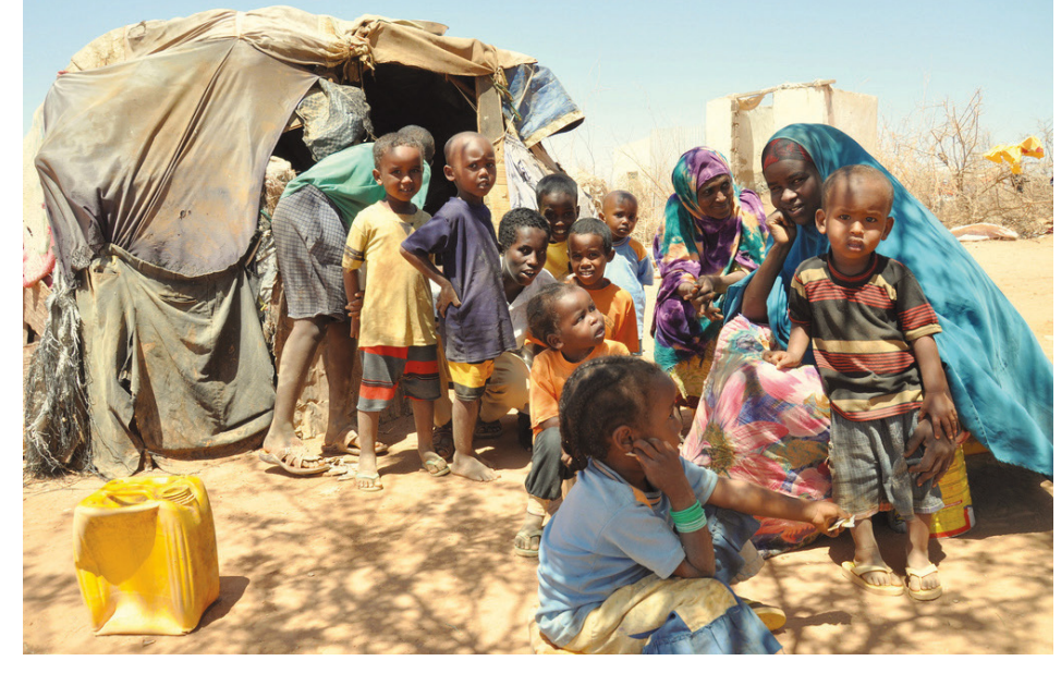
Horn of Africa famine refugee camp.