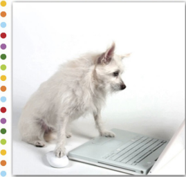
The Writing Watch Dog says... (touch the image to enlarge)

Many times you will have a choice about your writing topic. Deciding what to write about can be a very difficult job. But there are some activities that you can do to make the choice easier. These activities are called prewriting. Prewriting is the first stage of the writing process. In prewriting, you get ready to write by talking, thinking, and reading about possible writing topics.