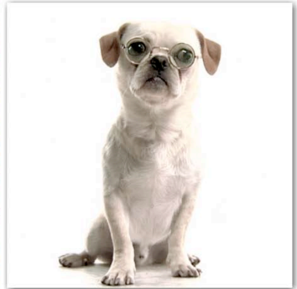
The Reading Watch Dog says... (touch the image to enlarge)

The plot of a story usually unfolds in a particular way. The introduction or opening describes the characters and the setting of the story. Next, the rising action happens. It is during this section of the plot that conflicts are introduced, and