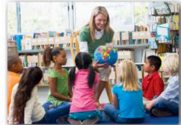
(touch the image to enlarge)

There are 7 boys and 8 girls in Emily's class at school. Are there more boys or girls in Emily's class?