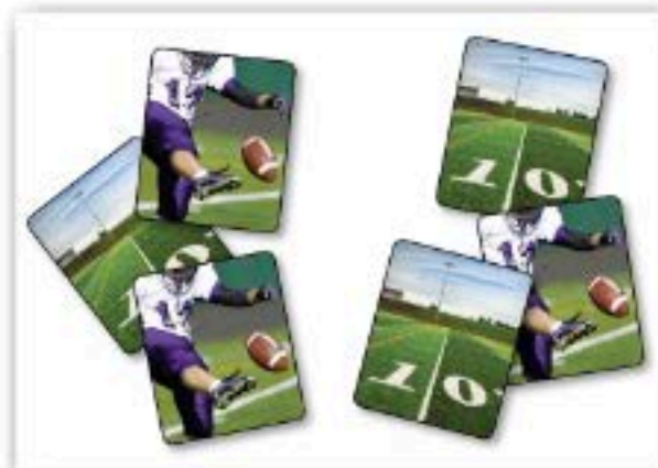
(touch the image to enlarge)