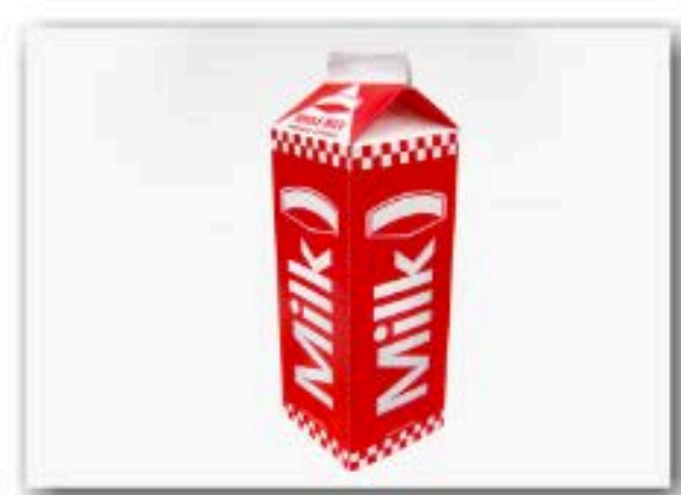
(touch the image to enlarge)

orange juice. How much milk and orange juice did they drink in all?