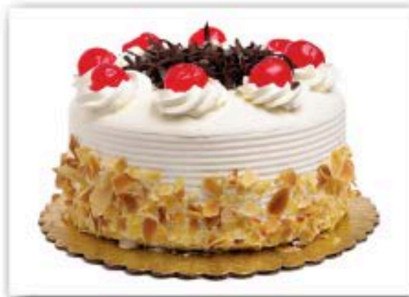
(touch the image to enlarge)

While helping her mother bake a cake, Lucy used \frac{1}{4} of a teaspoon ( 1 \frac{1}{4} milliliters) of baking soda and \frac{3}{4} of a teaspoon ( 3 \frac{3}{4} milliliters) of vanilla extract. How much more vanilla extract did Lucy use?