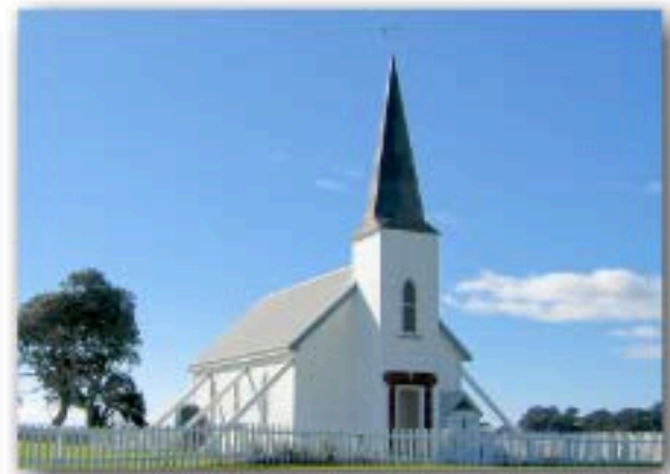
(touch the image to enlarge)

As you look at the side WELL DONE! Type of polygon is this: