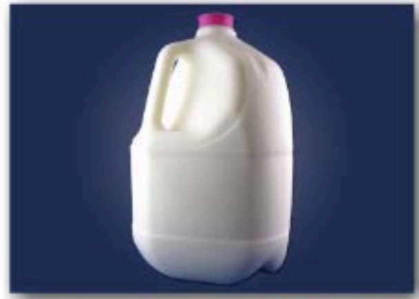
(touch the image to enlarge)

Every week, Daniel's mother goes grocery shopping and picks up 1 gallon (3.8 liters) of milk. Daniel drinks 0.75 gallons (2.8 liters) of milk a week. How many leftover gallons (liters) of milk will Daniel have after 3 weeks?