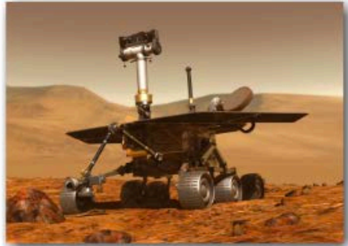
(touch the image to enlarge)

In January of 2003, two Mars Exploration Rovers , called Spirit and Opportunity , landed successfully on opposite sides of the planet. This exciting event was the final step in a number of earlier successes and failures at trying to get to Mars.