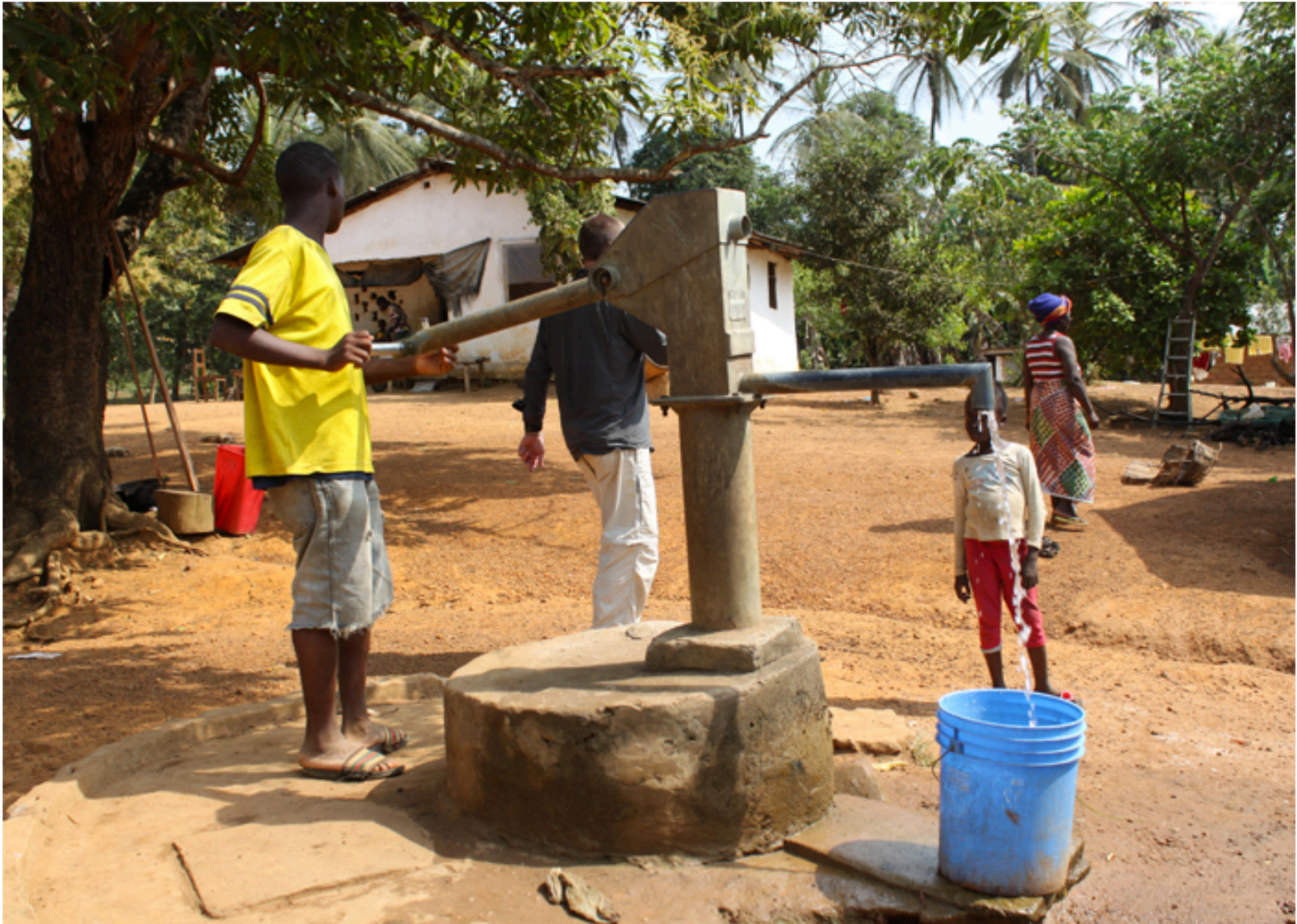
A water well in Africa.