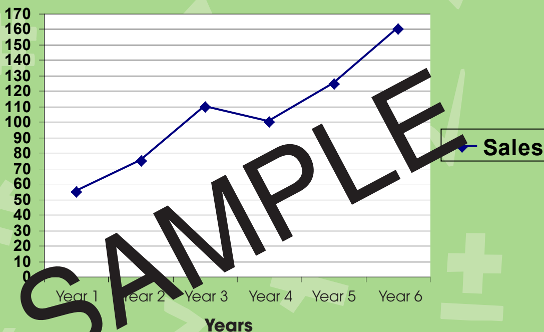
Christmas Fundraiser Bake Sale

The line graph below shows how much money the bake sales have sold over the past few years. Use the graph to answer the following questions: