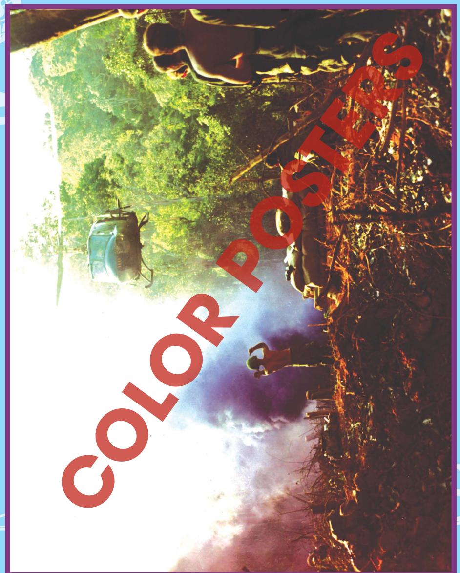
Helicopter picking up wounded from battlefield