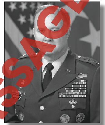
General H. Norman Schwarzkopf

On only the second day of the war the Iraqis fired eight Scud missiles into the cities of Tel Aviv and Haifa in Israel . It was a clever strategy on Saddam Hussein's part attempting to bring neutral Israel into the war - a country that was a bitter enemy of many of the Arab nations now allied against Iraq. Saddam knew that if Israel entered the war there would be an excellent chance that many of the Arab nations would rethink their stand against Iraq. Perhaps some of these countries would even switch sides and join him. The United States and its allies, however, were able to persuade Israel not to retaliate against Iraq, and rushed a new weapon to Israel - the Patriot air defense missile system. Altogether Iraq launched over 80 Scud missile attacks - many of them at its neighbor, Saudi Arabia .