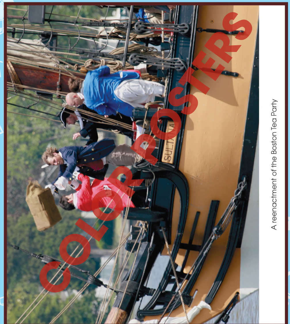
A reenactment of the Boston Tea Party