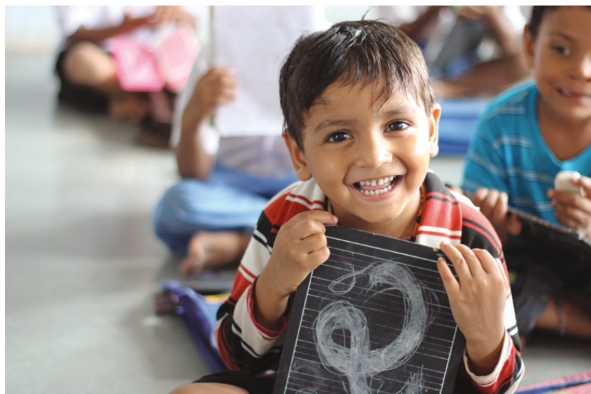
Cisgender Boy to Man

Being cisgender is seen as 'normal'. Most people think that a baby will grow up and continue to identify with the gender they were given at birth. Sometimes this does not happen.