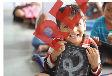
Cisgender Boy to Man

Being cisgender is seen as 'normal'. Most people think that a baby will grow up and continue to identify with the gender they were given at birth. Sometimes this does not happen.