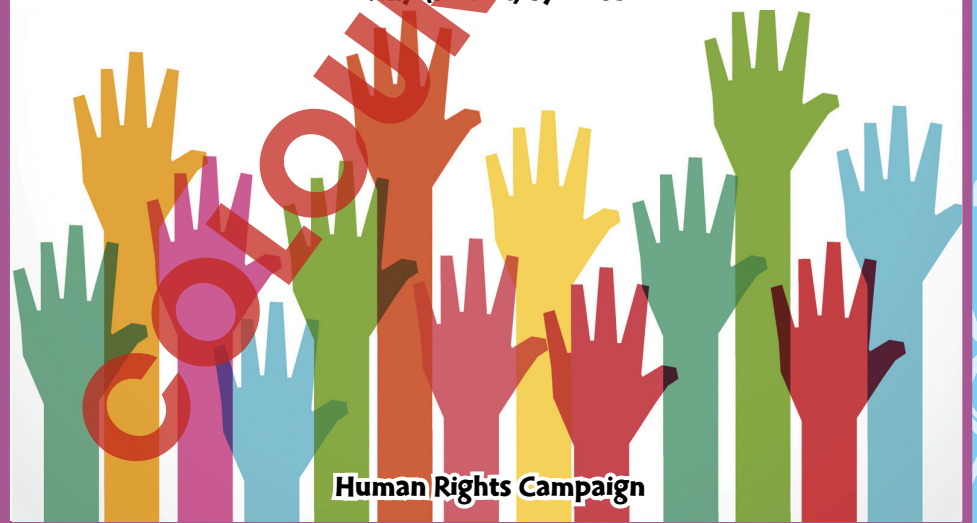
Human Rights Campaign