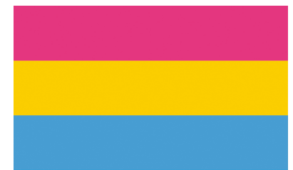
Pansexual Pride Flag