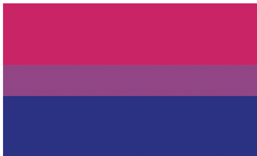
Bisexual Pride Flag