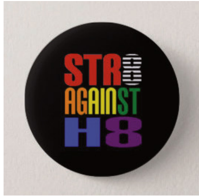
Ally (Friend) Pin