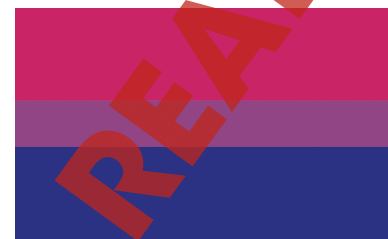
Bisexual Pride Flag