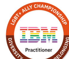
Support from Businesses