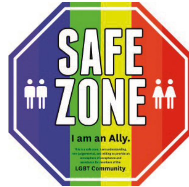
Ally (Friend) Sticker