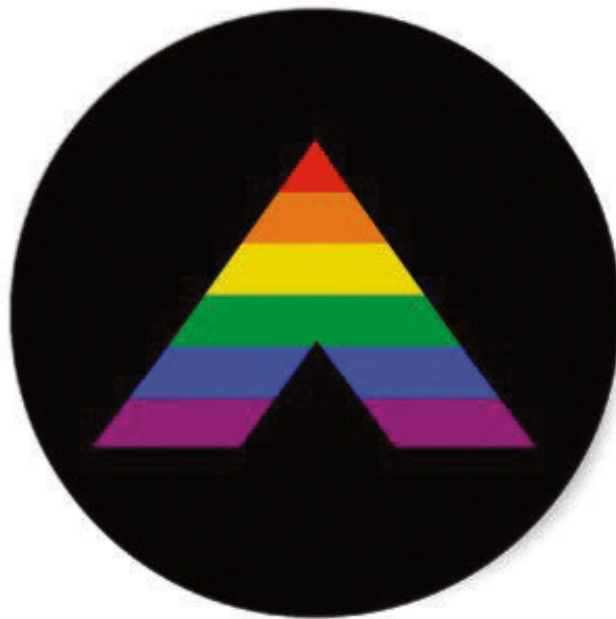
Ally (Friend) Symbol