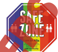
Ally (Friend) Sticker