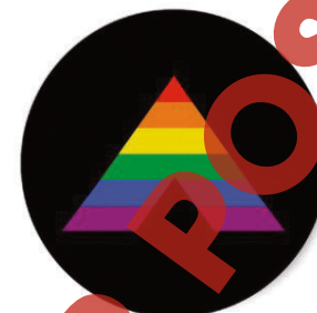
Ally (Friend) Symbol