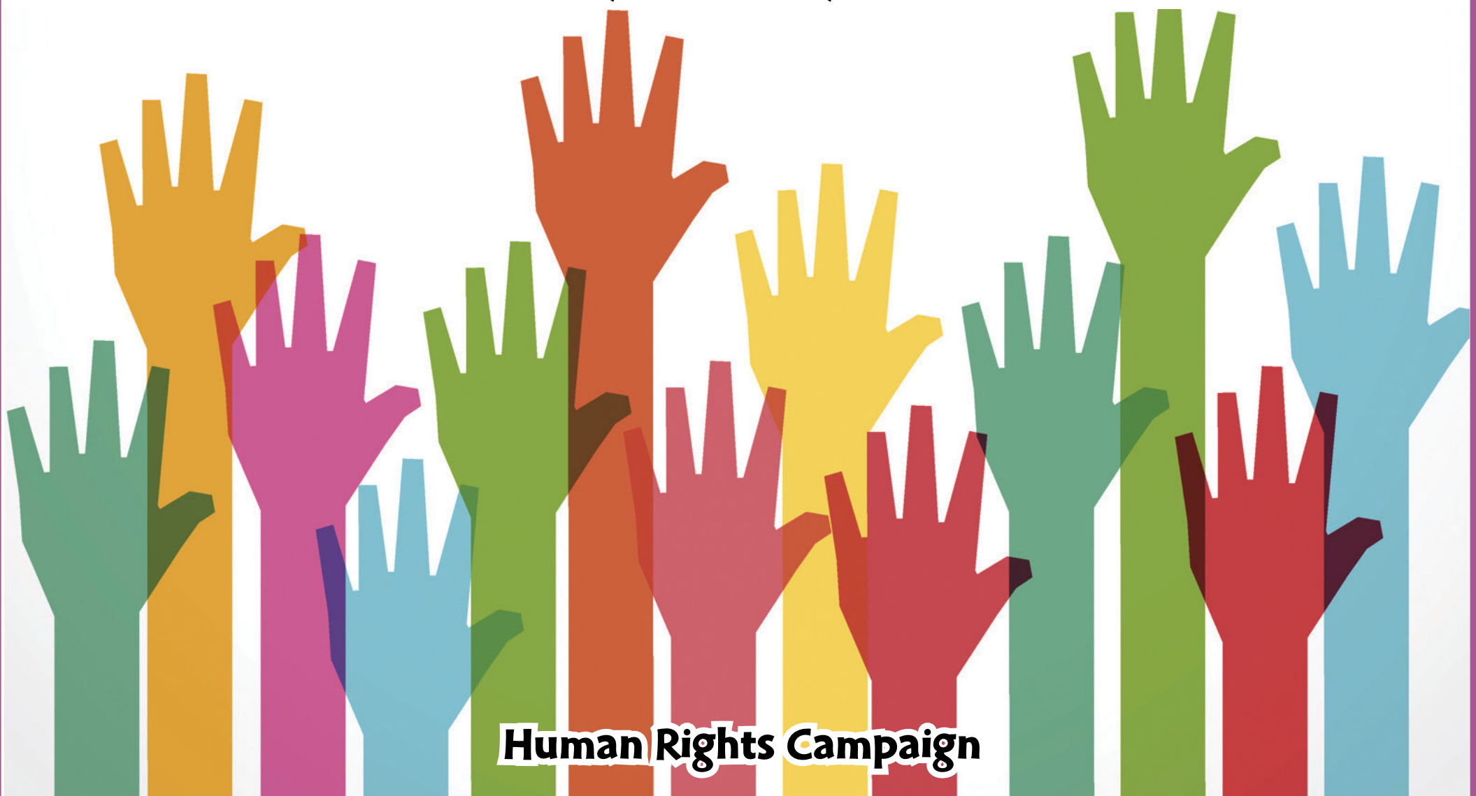
Human Rights Campaign