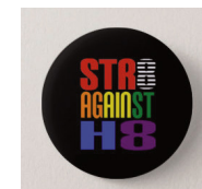
Ally (Friend) Pin