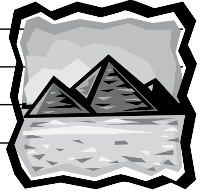
Figure It Out!