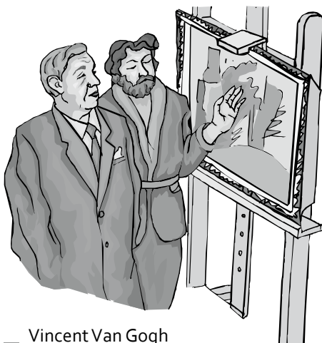
Vincent Van Gogh