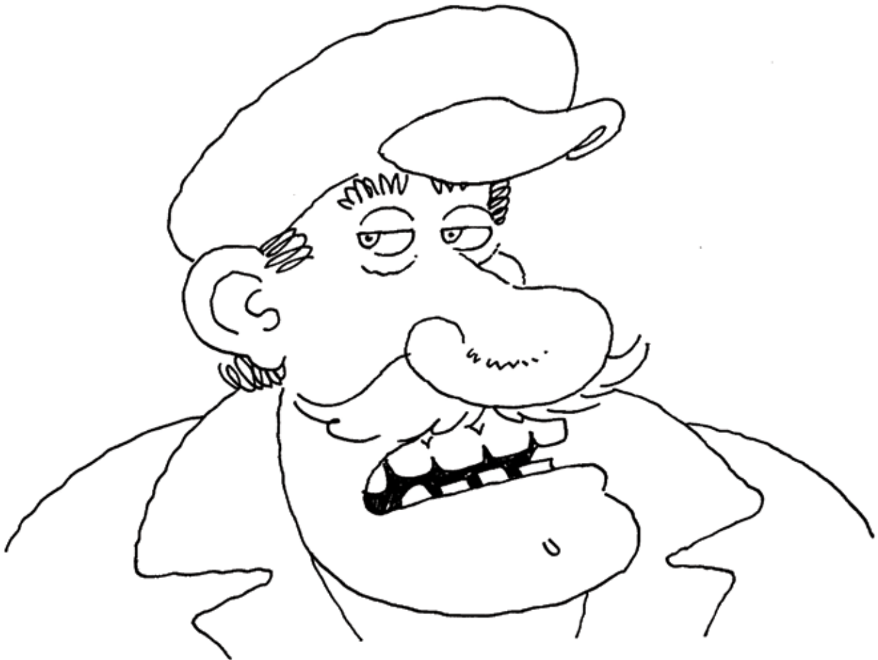
B. F. Cunningham, Exploring the Unexplained (Niles, IL: United Learning, 1976), filmstrip.

"The Bermuda Triangle? The Graveyard for Lost Ships, I call it. Suspicious I may be, lad, but I'd not sail into those waters for all the booty in the Deep Six. In the past hundred years, no less than forty ships and twenty airplanes have disappeared out there, and all without a single trace. None of 'em sounded distress calls. None of 'em responded to radio signals. No wreckage was ever found. No survivors ever picked up. No bodies ever discovered. No nothin', lad."