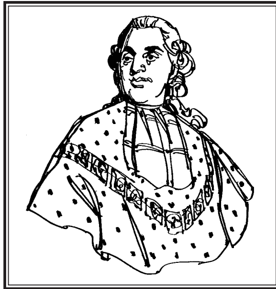
Louis XVI provoked his subjects with high taxes

The king's response was harsh. On June 20, he closed and locked the doors of the room in the palace at Versailles where the third estate was to meet. This brought the king and the third estate into direct confrontation.