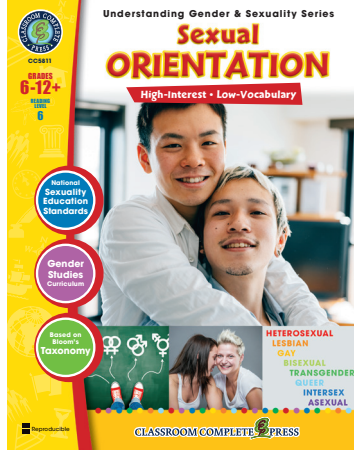
CC5811 SEXUAL ORIENTATION